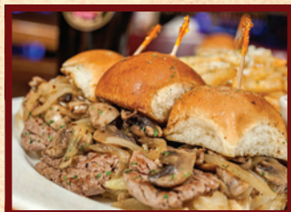
Filet Mignon Sliders