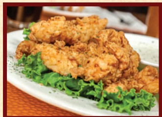
Chicken Breast Tenders

(2) chicken tenders, (4) brew wings-choice of sauce, (2) southwest eggrolls, (4) mozzarella cheese sticks, (2) potato skins, (6) cowboy bites; served with marinara sauce, avocado Greek yogurt aioli, and ranch dressing