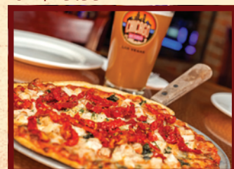
Uptown Roasted Garlic Chicken