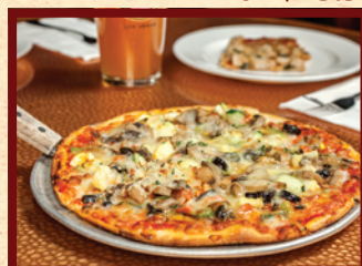
Lake Shore Drive Veggie